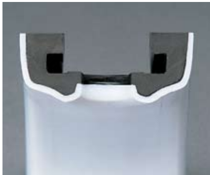
Seat cross-section at stem hole.

BRAY'S UNIQUE SEAT DESIGN is one of the valve's key elements. The elastomer backed PTFE seat features a tongue and groove retention method which holds securely between either slip-on or weld-neck flanges and also allows simple and fast field replacement. This EPDM backing provides resilient support for the molded PTFE, thus maximizing the shut-off and cycle life of the seat.